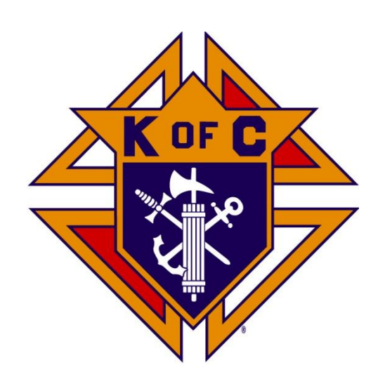
Future Council Meetings July 8, August 12, September 9